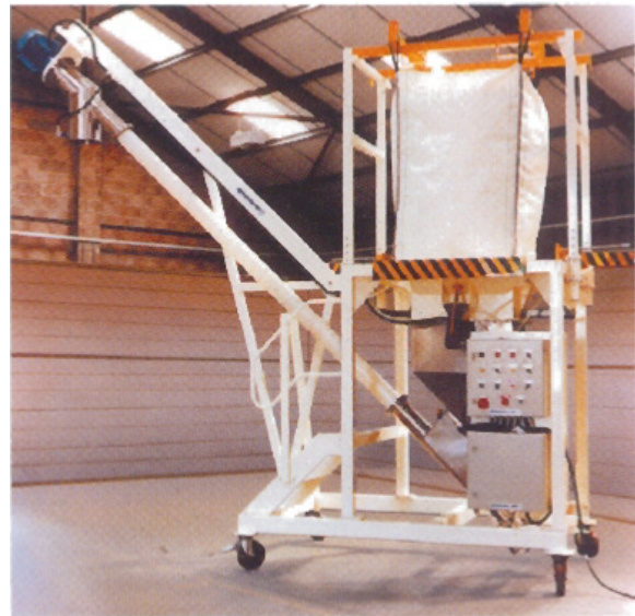
Mobile bulk bag discharger