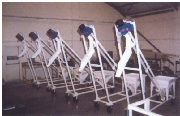
Special purpose mobile units with outlet diverter chutes