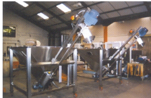
Special purpose mobiles with large capacity feed hoppers