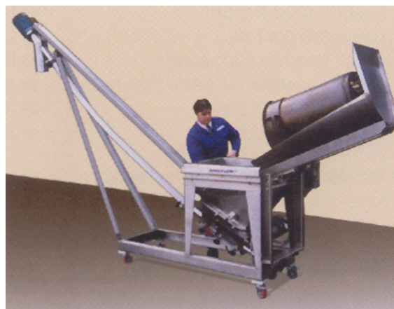
Mobile conveyor with integral drum dumper