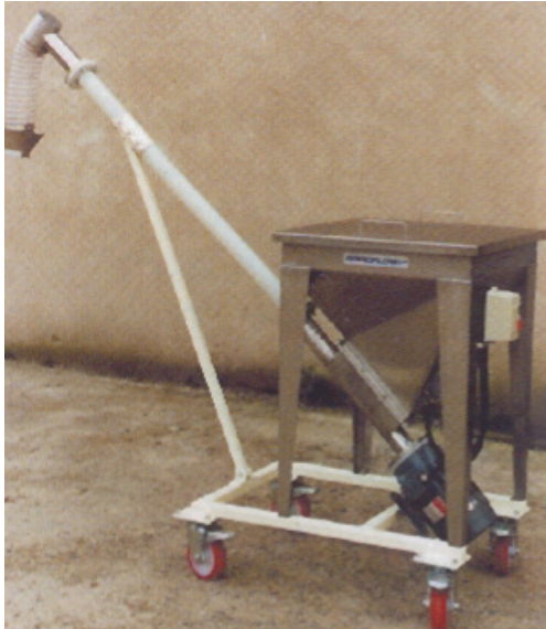
Standard mobile feeder with 'pusher' type conveyor